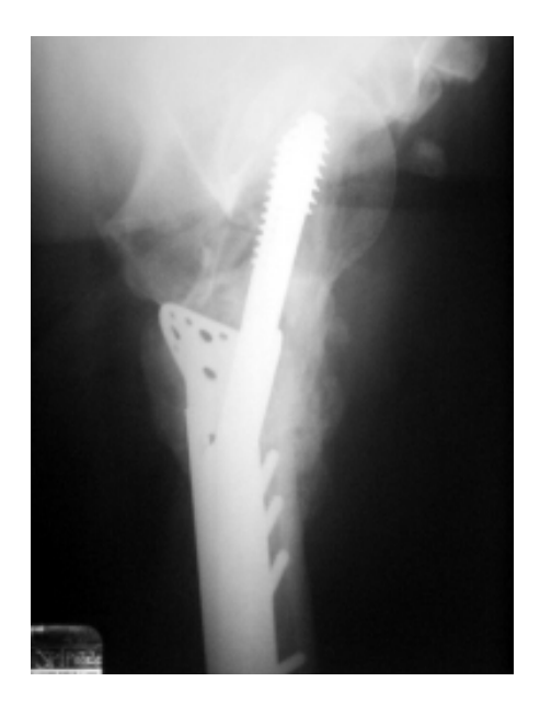
Fig. 4 At fifteen months follow up, the femoral neck and the reverse obliquity intertrochanteric fractures healed uneventfully

The secondary fracture healed at ten weeks post operation. There was no avascular necrosis or femoral head collapse at fifteen months of follow up (Fig. 4).