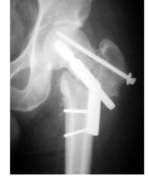
Fig. 3 Subtrochantanic or reverse obliquity intertrochanteric fracture with medial displacement at 3 weeks after DHS fixation

Three weeks after the revision surgery, the patient experienced marked pain in his left hip and was unable to bear weight on the extremity. Roentgenogram demonstrated femoral fracture through the sliding screw portal with medial displacement (Fig. 3). Choice of an internal fixation device was discussed and the operative procedure was planned. The operation was performed on a fracture table with slight traction of the limb to reduce the secondary subtrochanteric fracture. The femoral neck fracture was temporarily fixed with