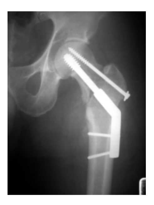
Fig. 2 After removal of the cannulated screws, the fracture was stabilized with DHS and an anterotational screw

Three weeks after the revision surgery, the patient experienced marked pain in his left hip and was unable to bear weight on the extremity. Roentgenogram demonstrated femoral fracture through the sliding screw portal with medial displacement (Fig. 3). Choice of an internal fixation device was discussed and the operative procedure was planned. The operation was performed on a fracture table with slight traction of the limb to reduce the secondary subtrochanteric fracture. The femoral neck fracture was temporarily fixed with