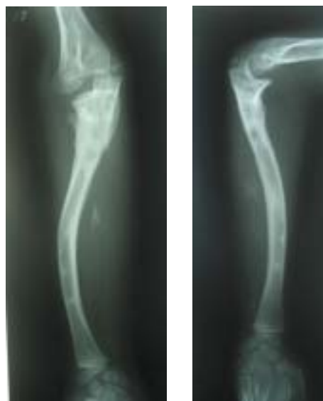
Figure 4. Final radiographs after implants removal, showing a one bone forearm.