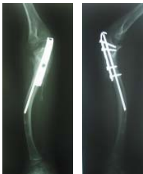
Figure 3. Eight weeks after Ilizarov fixator removal and internal fixation with a plate, screws, intramedullary pin and iliac bone graft to create a one-bone

Also, the proximal ulna was apposed to the distal radial segment, and these bones were fixed with an intramedullary pin and 1/3 tubular plate. Autogenous cancellous bone grafts from the iliac crest were placed around the junction. Histologic examination of the resected bone and soft tissue showed reactive bone, hyaline cartilage, and dense fibroconnective tissue consistent with a congenital pseudarthrosis. A long arm cast was worn postoperatively for 6 weeks and exercise started after removal. The radiographs showed complete union at 8 weeks after surgery (Fig 3.). The intramedullary rod and plate were removed 8 months after fixation (Fig 4.). At two years follow up, the patient had good hand function with forearms of equal length, and he could lift objects heavier than 7 kilograms. Elbow power of the right forearm was comparable with the left one and there was a full range of flexion and extension motion. Pronation was limited by 10° and supination was 30°. Elbow function was stable and pain-free (Fig 5.)