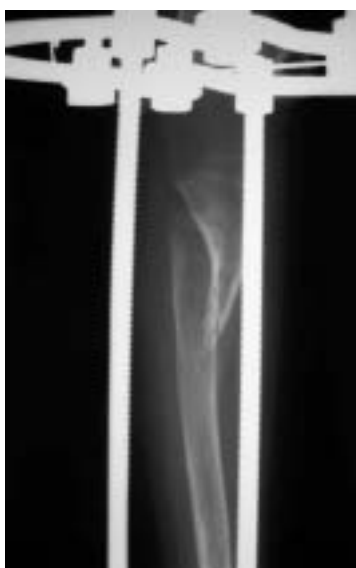
Figure 2. The position of the proximal radius 2 months after gradual distraction with Ilizarov fixator.

Also, the proximal ulna was apposed to the distal radial segment, and these bones were fixed with an intramedullary pin and 1/3 tubular plate. Autogenous cancellous bone grafts from the iliac crest were placed around the junction. Histologic examination of the resected bone and soft tissue showed reactive bone, hyaline cartilage, and dense fibroconnective tissue consistent with a congenital pseudarthrosis. A long arm cast was worn postoperatively for 6 weeks and exercise started after removal. The radiographs showed complete union at 8 weeks after surgery (Fig 3.). The intramedullary rod and plate were removed 8 months after fixation (Fig 4.). At two years follow up, the patient had good hand function with forearms of equal length, and he could lift objects heavier than 7 kilograms. Elbow power of the right forearm was comparable with the left one and there was a full range of flexion and extension motion. Pronation was limited by 10° and supination was 30°. Elbow function was stable and pain-free (Fig 5.)