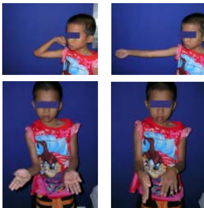
Figure 5. Final examination 24 months after the one-bone forearm operation showing the patient with a stable and pain free elbow and forearm of equal length. He had full range of flexion and extension motion of the right elbow with limited forearm rotation.

neurofibromatosis, which was reviewed by Witoonchart in 1999. (17) He reported that 73% of cases had signs or positive family history. Treatment of congenital pseudarthrosis of the ulna is challenging and difficult. The aims are stabilizing the extremity, preventing shortening and deformities, and improving hand function. In most cases, brace or cast immobilization alone is likely to fail in producing union, especially in patients with neurofibromatosis. (1,2,6,10) Several investigators have reported successful attempts with various surgical procedures. Treatment decision must take into account the patient's age, number of previous surgeries, amount of bony defect, availability of distal ulnar epiphysis, stability of the elbow, and surgical expertise. Non vascularized bone grafting with or without internal fixation is an option, but inappropriate for patients with a large bone gap. (6,7,10)